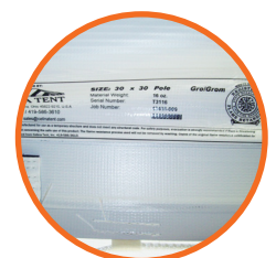
IDENTIFICATION LABEL FLAME CERTIFICATE