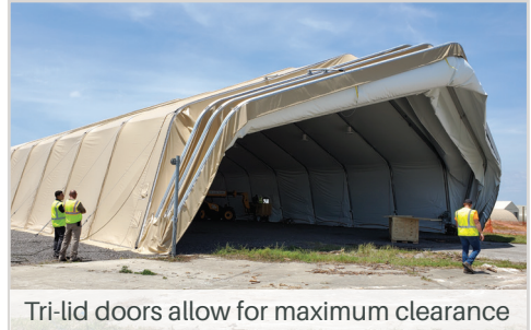
when entering the shelter