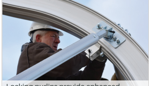
Locking purlins provide enhanced stability across the shelter