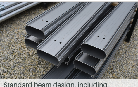
Standard beam design, including integrated keder track