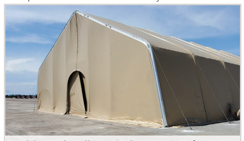
Gable end walls provide supports for personnel doors and entry ways

*Camouflage green 483 fabric color options available for all LAMS shelters. Standard sizes listed LAMS attributes can be modified at the customer's request to provide shelters to match any need.